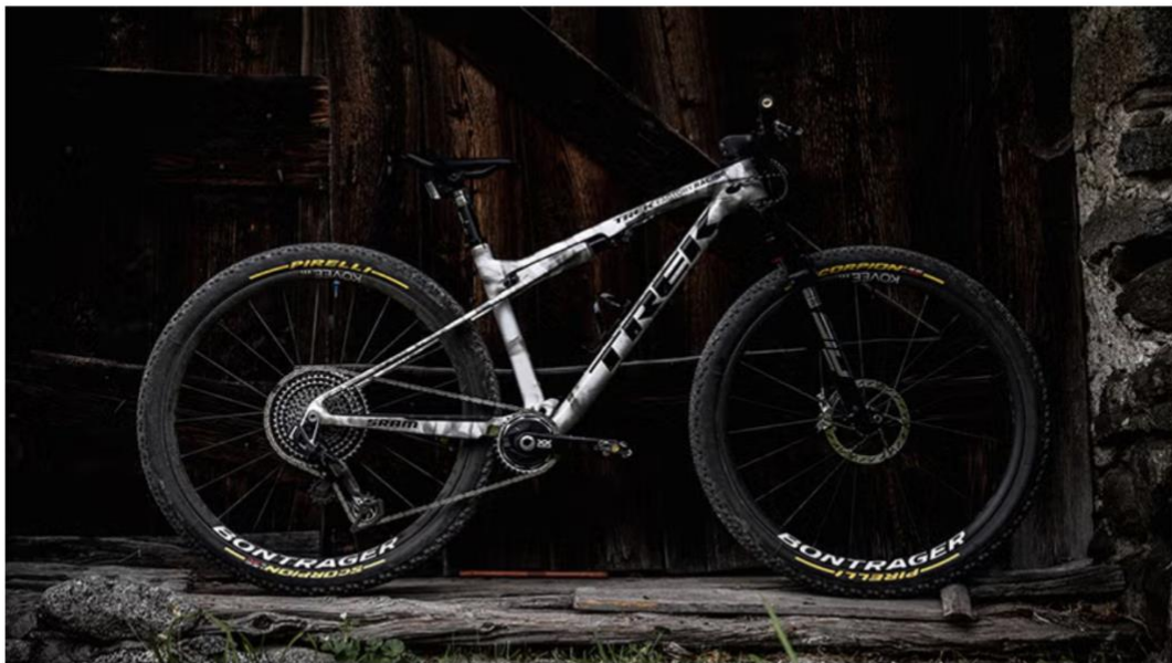
World Bicycle Relief

The British ride and cross-country world champ in 2021 and will donate a Trek Factory Racing team-edition Trek Supercaliber 9.9 .