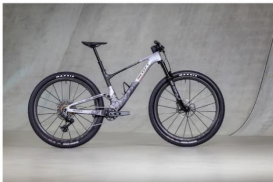
World Bicycle Relief

The 2018 world cross-country champ is donating a one-of-a-kind Scott Spark RC equipped with SRAM, RockShox, and Syncros components in a unique design inspired by women in cycling and the upcoming 2023 MTB World Championships.